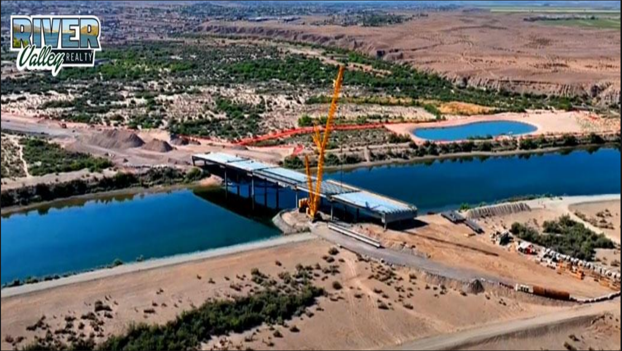
Above: Aerial from Nevada looking to Southeast at the Laughlin - Bullhead City bridge site. Below: Looking south along Arizona's West Coast and property Colorado River shoreline.